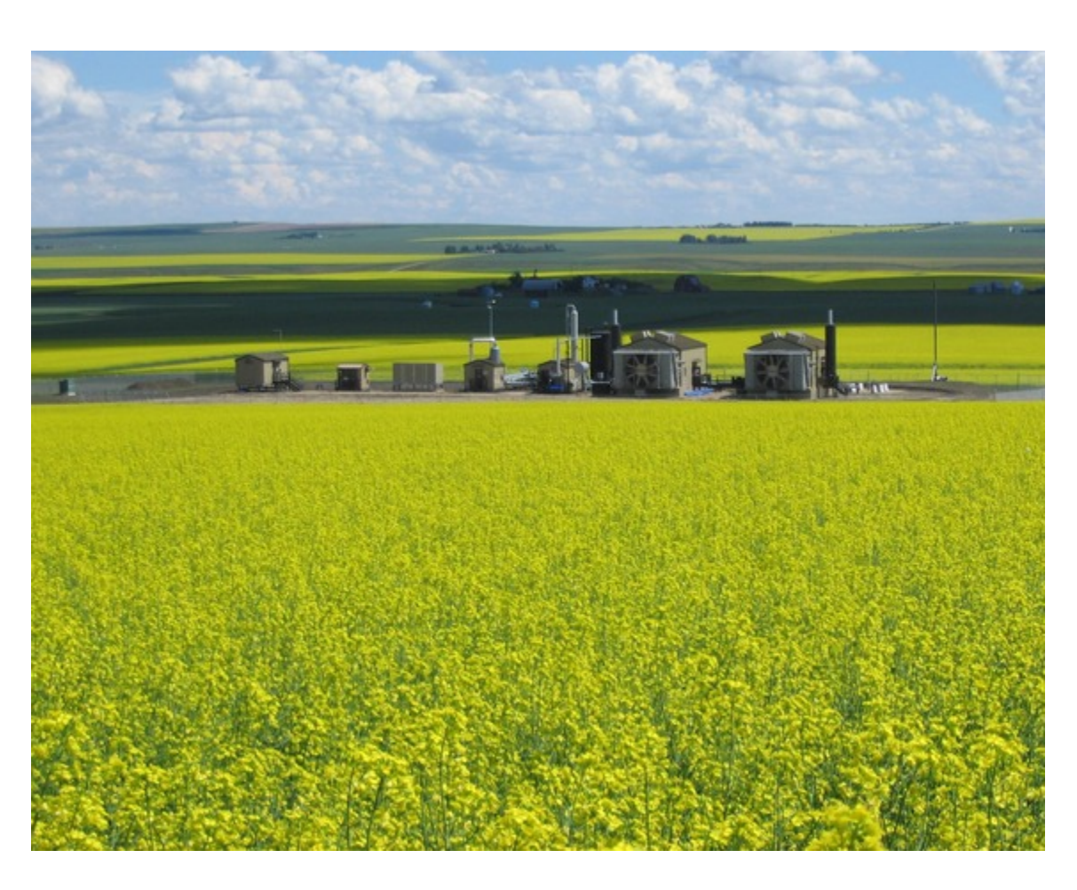
New work kicks off at the AWC