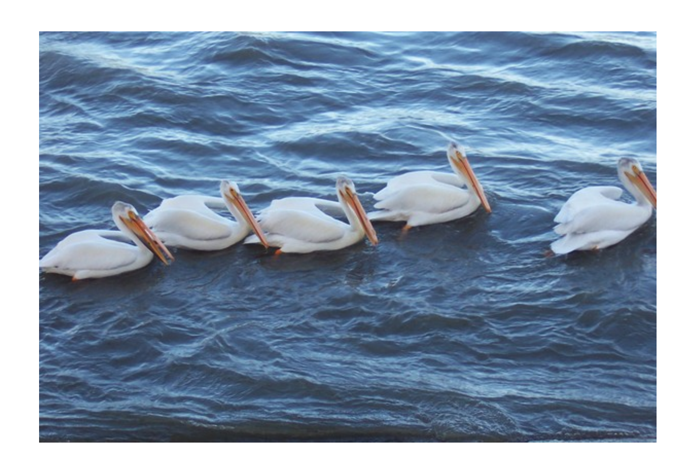
Diving in--lakes in Alberta video

The AWC released a short video about lakes in Alberta. To view the video go https://www.youtube.com/watch?v=sGX99W2pA9Q