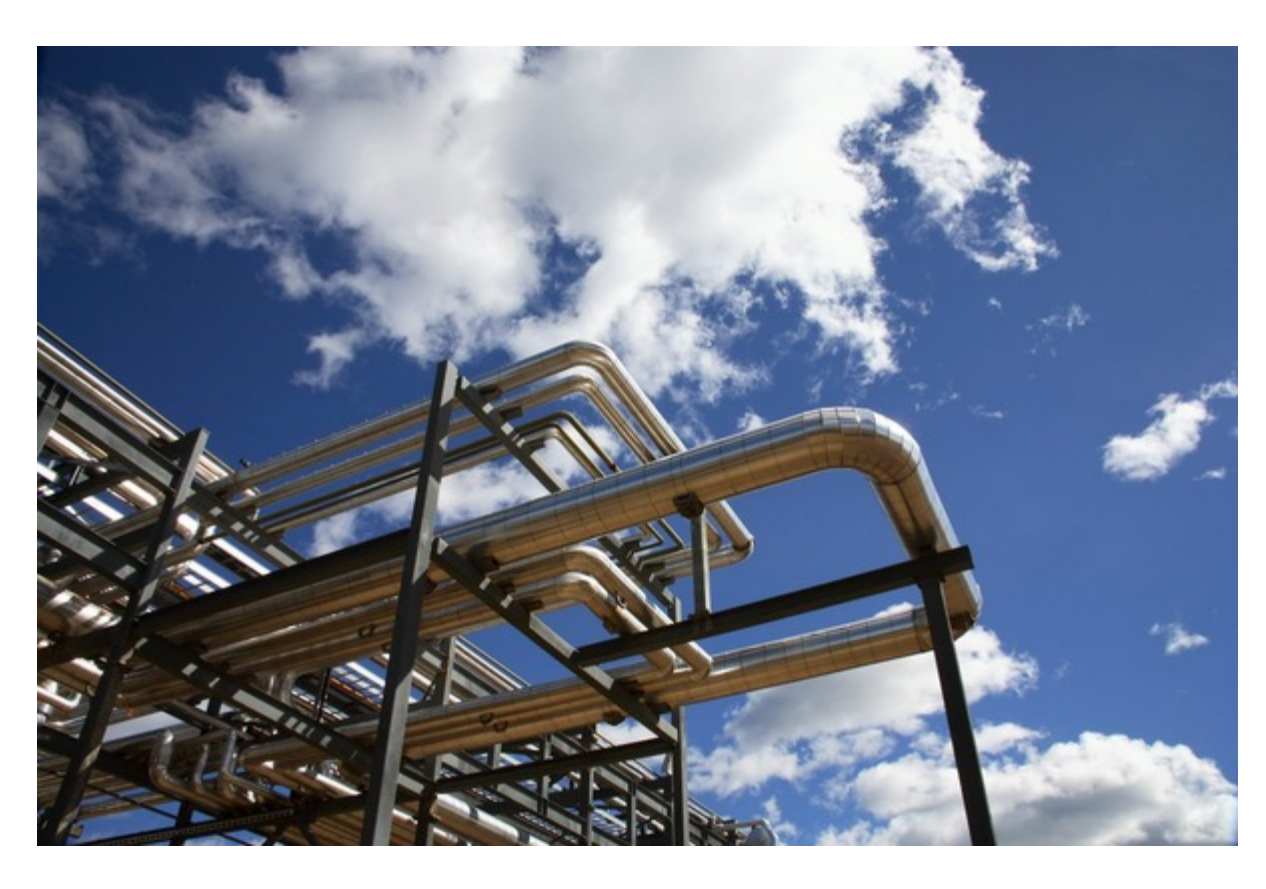
Evaluating Water CEP Project Team shares findings and draft recommendations

In early 2016, the Evaluating Water CEP Project Team was established to report on the contributions of water-using sectors towards achieving Water for Life goals, the 30% target and CEP desired outcomes. In 2015, sectors provided progress reports to the AWC. Presentations included key successes and challenges in implementing CEP activities and obtaining targets set out in sector plans. The following aspects were documented by each sector: