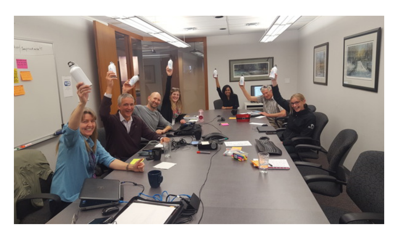
The report will be finalized and printed in the next month or two. More information about the Water for Life Implementation Review Committee can be found here .