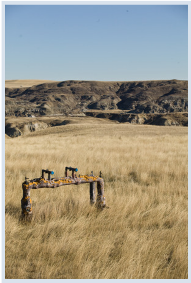
The next AWC board meeting will be held Thursday 16 March, 2017 in Edmonton.