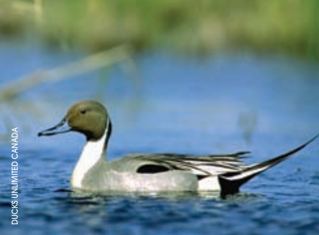
DUCKS UNLIMITED CANADA